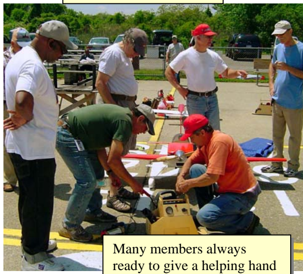
Many members always ready to give a helping hand