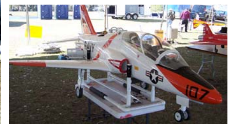
Some of the many beautiful planes flown at Florida Jets 2010